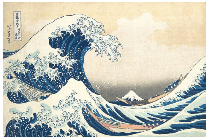
The great wave off Kanagawa by Katsushika Hokusai is licensed under CC BY 2.0.