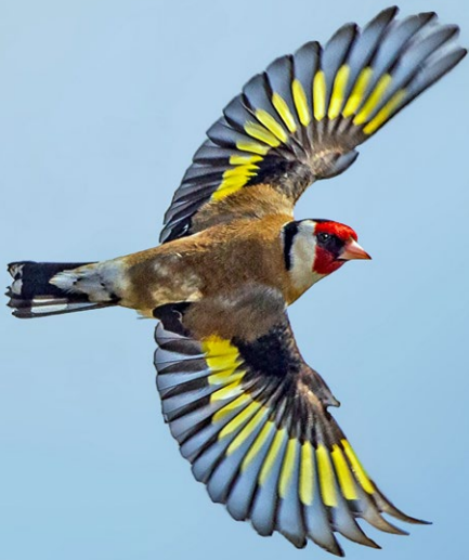
"Goldfinch in Flight" by Clive Brown