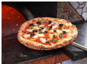
Cheese, olives, pepperoni pizza - Italy

Find out what sort of food they eat in different countries. Draw and label pictures to share what you found out.