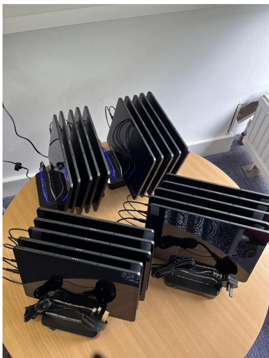
New tablets for classroom learning